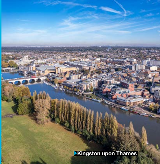
▶ Kingston upon Thames