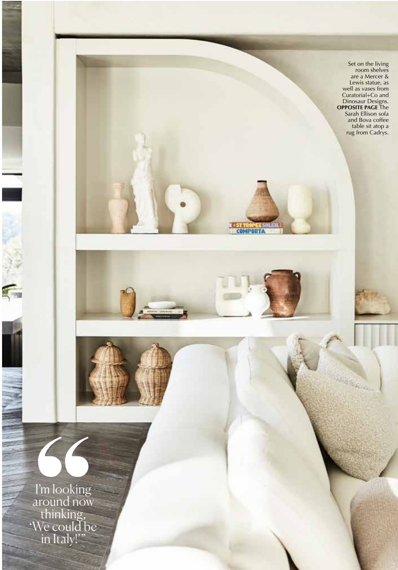
Set on the living room shelves are a Mercer & Lewis statue, as well as vases from Curatorial+Co and Dinosaur Designs. OPPOSITE PAGE The Sarah Ellison sofa and Bova coffee table sit atop a rug from Cadrys.

“ I'm looking around now thinking, 'We could be in Italy!'”